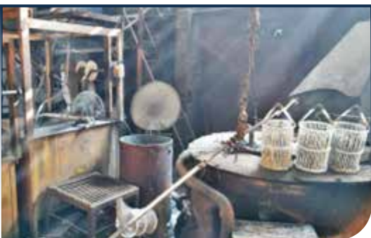
HOT DIP GALVANIZING