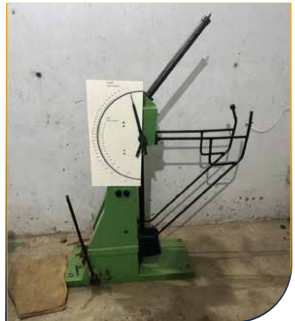
IMPACT TESTING MACHINE