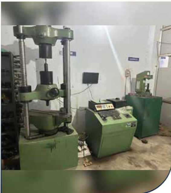
UTM (TENSILE TESTING MACHINE)